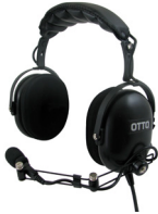
Heavy Duty Dual Ear Cup