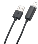
USB Replacement Cable