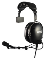
Heavy Duty Single Ear Cup