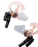
SureFire Ear Piece Upgrade For Hurricane